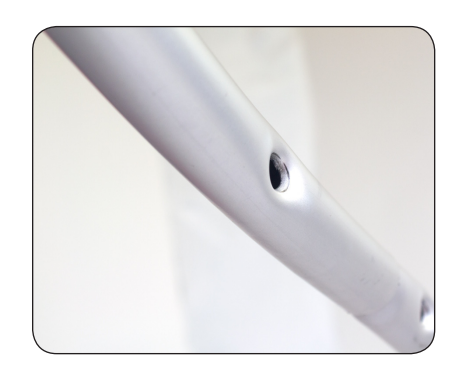
* Make sure that when you screw the screws into the poles that you notice the indents on the S and Curved poles. The head of the screw should fit snug into those grooves.

Grab one of the completed sides and starting from the S pole making your way up, connect the 3 heavy weight poles closest to the S and the lighter weight poles making your way up the Curved poles.