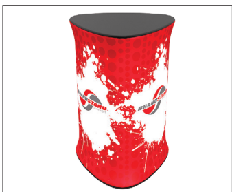
8. Turn counter back over.