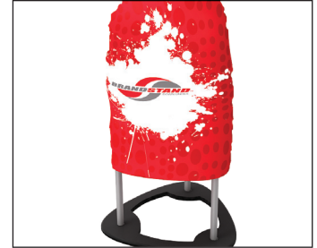
4. Slide fabric graphic wrap onto hardware. Align seam to center of back of counter.