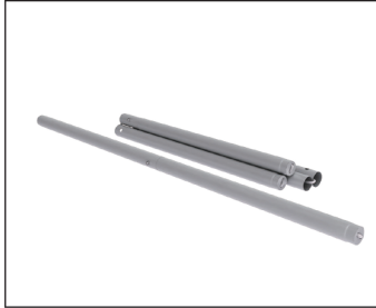
1. Extend and lock the support poles.