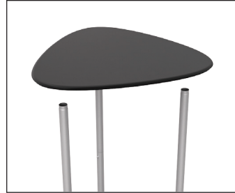
3. Place counter top onto poles. Tap down with hand to secure.