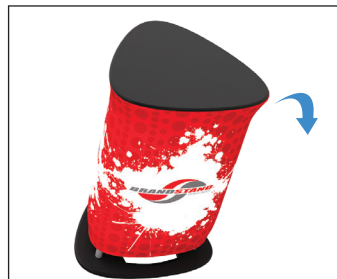
6. Turn counter upside-down.