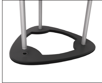
2. Place the 3 poles with the holes facing up.