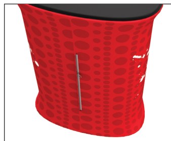
9. The zipper on the back is used to access inside the unit.