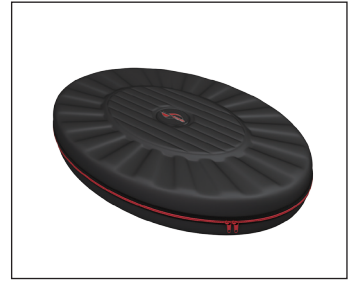
1. Remove the counter from the molded soft bag.