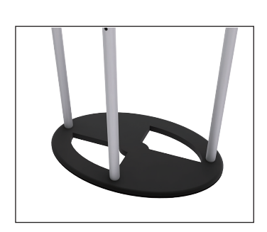
3. Place the 3 poles with the holes facing up.