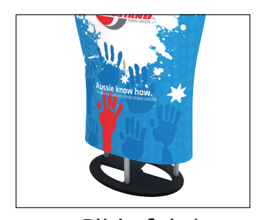
5. Slide fabric graphic wrap onto hardware. Align seamto center of back of counter.