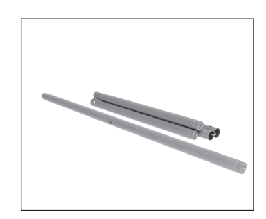
2. Extend and lock the support poles.