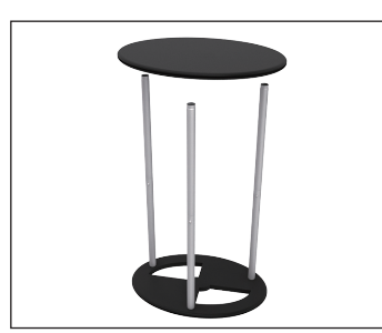
4. Place counter top onto poles.Tap down with hand to secure.