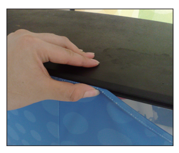
Angle and tuck gasket into channel in edge of counter top.Insert graphic gasket all the way around.