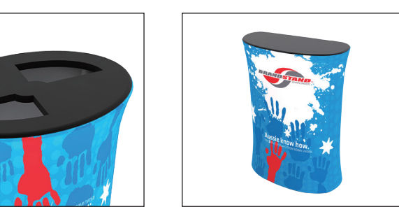
9. Turn counter back over.