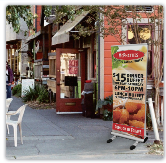
Perfect for outdoor messages