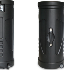
Includes qty 1 Medium Hard Case Case Inside Dimensions: 20.5"W x 32.5"H x 12"D