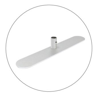
Single Foot (34mm) (qty 2)