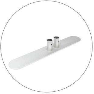
Double Foot (34mm) (qty 1)