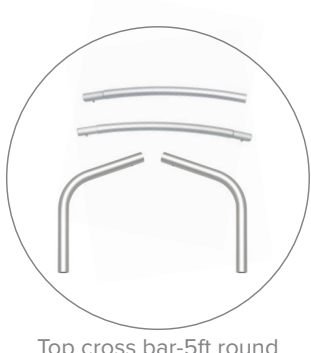
Top cross bar-5ft round (qty 2)