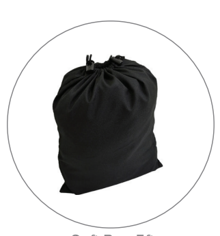
Soft Bag 5ft (qty 2)