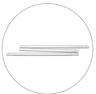
3 section 64" pole (qty 4)