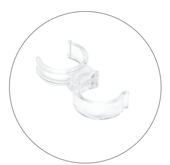
Connecting Clip (qty 4)